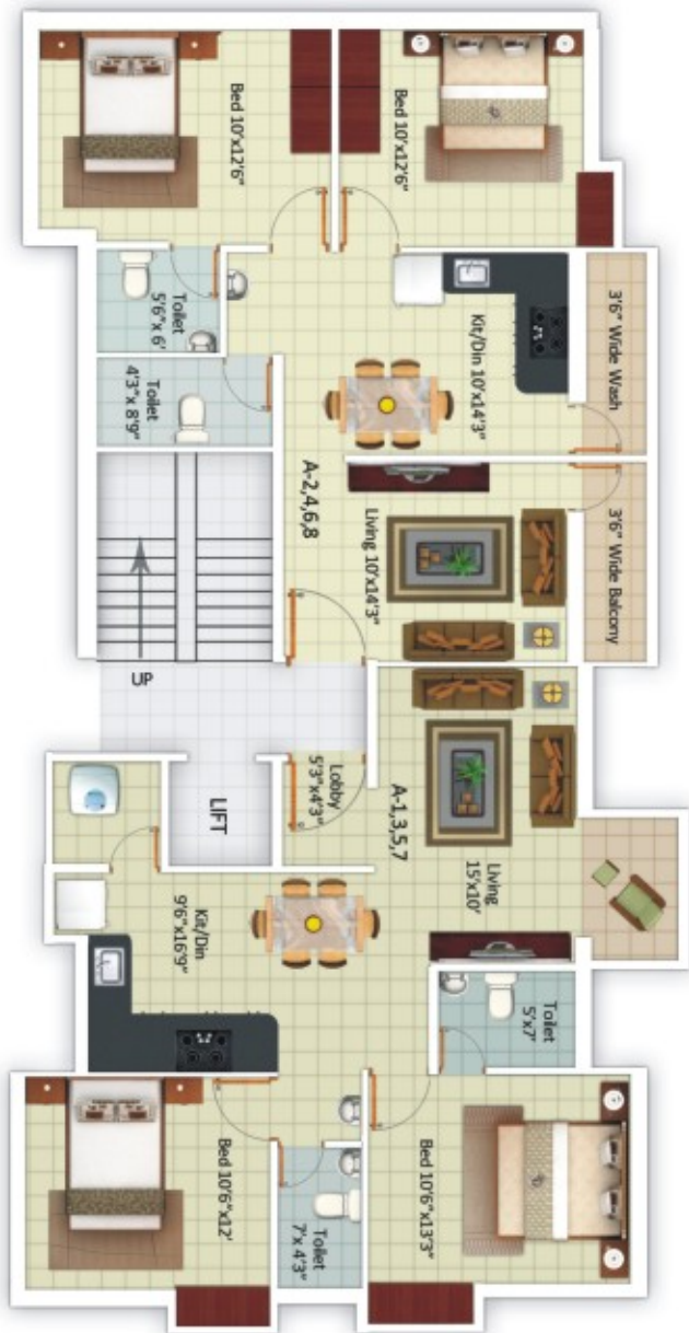
Floor Plan A-2BHK