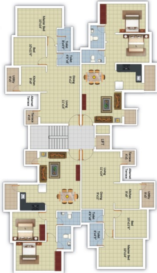
Floor Plan C-2BHK