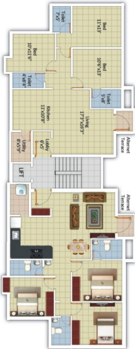
Floor Plan D&E-3BHK