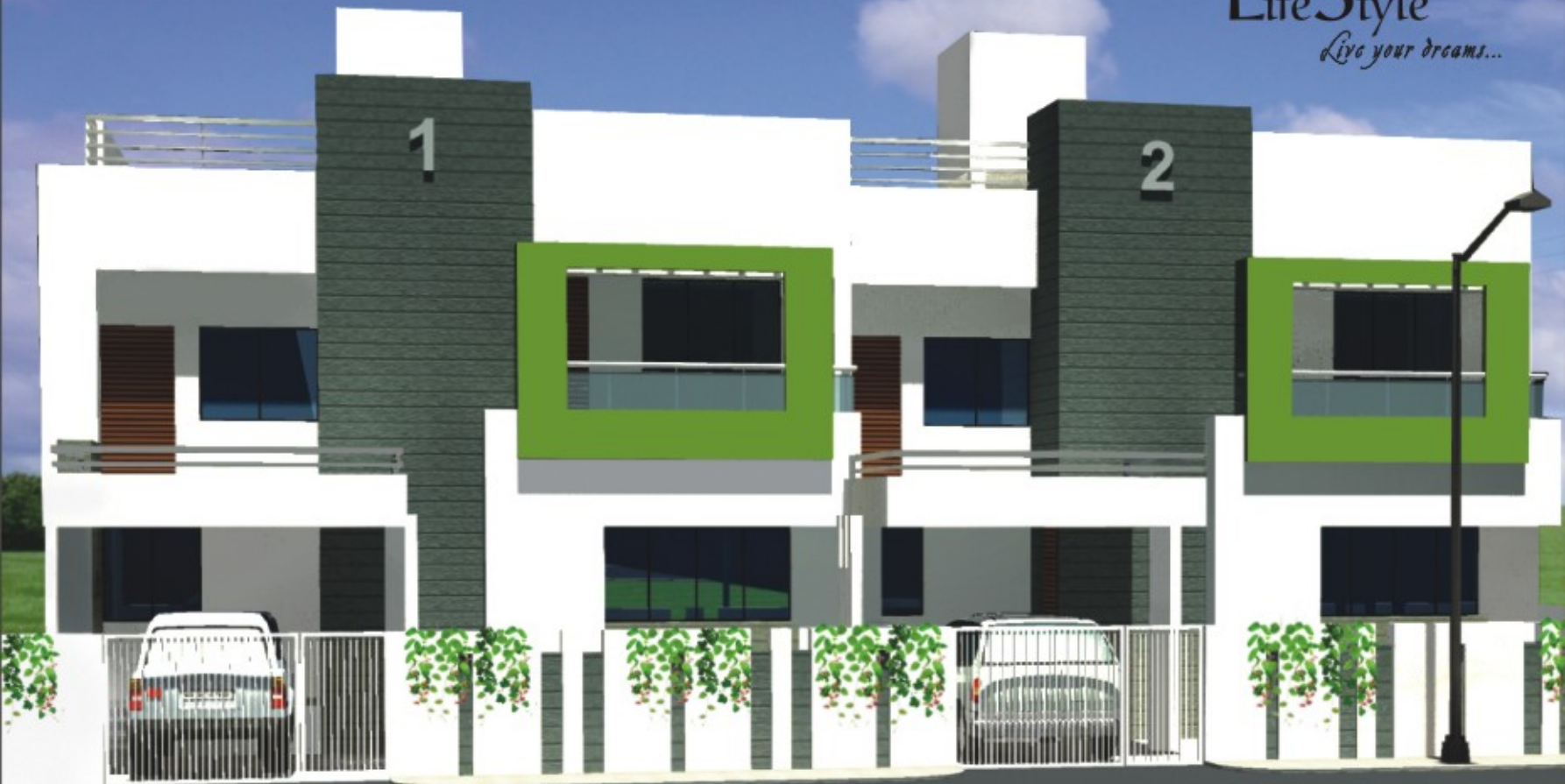
Front View of 3&4 BHK Bungalow