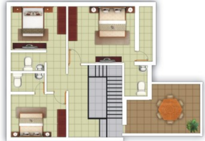
Floor Plan 4BHK Bungalow